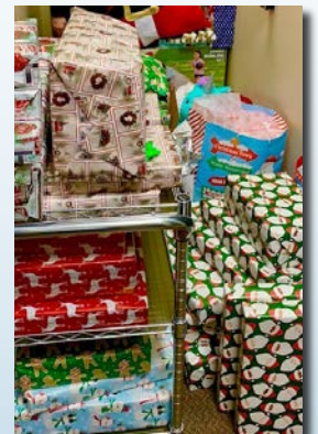
Everyone did great gathering gifts. We made 12 kids have a very Merry Christmas