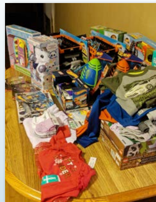
Christmas Angel Gifts