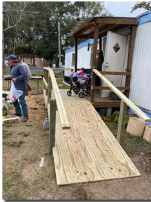
Ramp project for local family