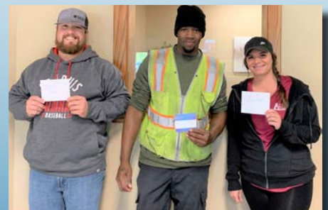
Cosume Contest Winners back in their work clothes