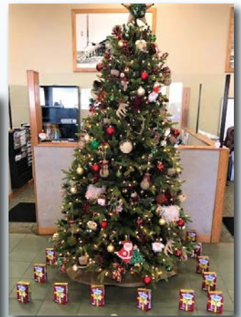
Christmas in Longview