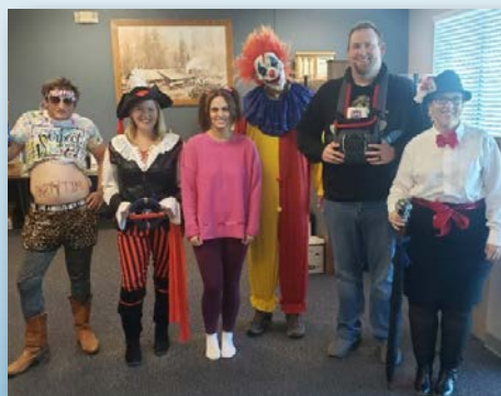
Halloween Costume Contest