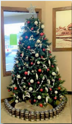
Christmas Party with personalized employee tumbler gifts