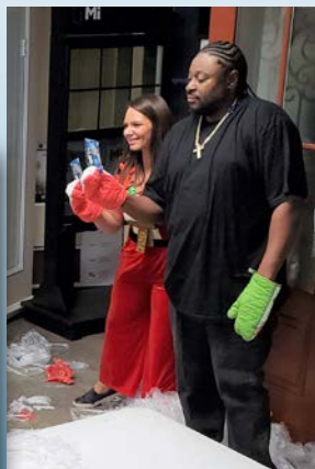
Gift Wrap Challenge winner at the Christmas Party (left)