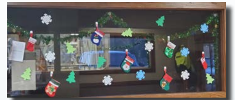
All the stockings hung by the chimney, uh breakroom with care