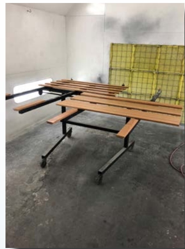
Panels have been sprayed and are drying in the paint booth. Then they will move to assembly and go to location for installation.