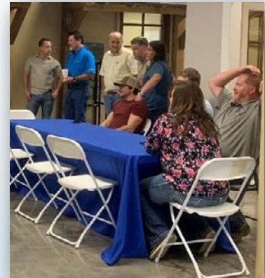
AC crew with spouses at Thanksgiving