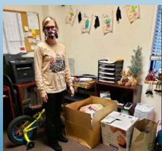
Terrell gathering gifts for their local family