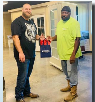
Thanks for 5 years Tee