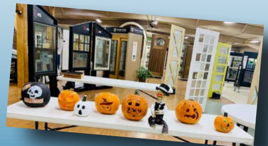
Pumpkin Contest Entries