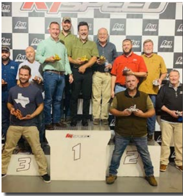
1st, 2nd & 3rd Place Winners at the Leadership Development Program Race off