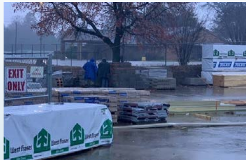
These guys pulling out all the stops in the rain to complete inventory