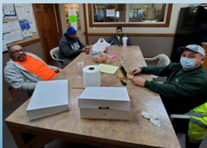
Taking a moment to reflect and warm up