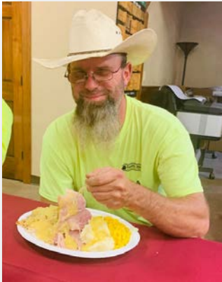
Man sized plate right here