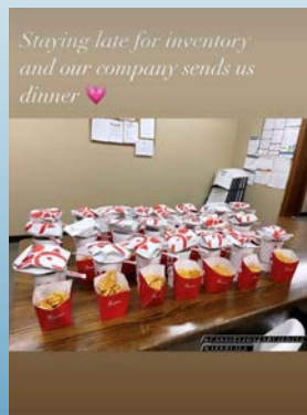
Inventory Surprise Meals