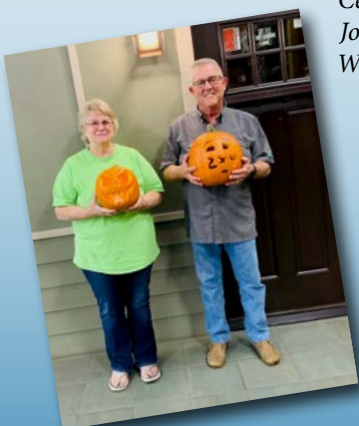
Overall Winner & Most Creative Winner