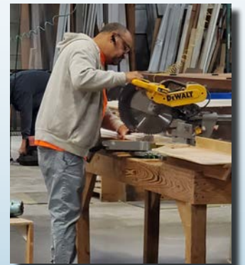
Otis measuring twice and cutting once