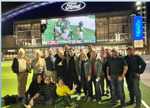
Leadership Summit Members