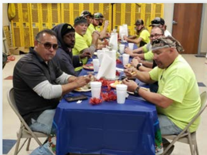
Christmas lunch with our team