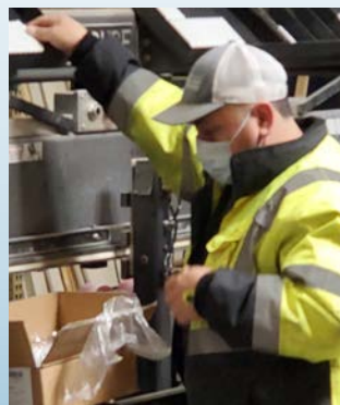
Shorty determined to get that last door done before the end of the day