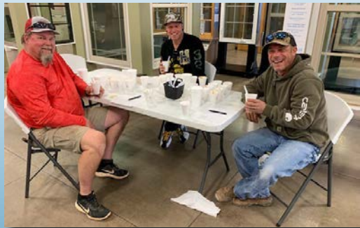
Our chili judges