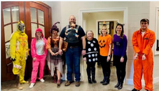
Costumes-Hazmat Team, Mama Shark, Hocus Pocus, Hang Over, Dominoe, Pumpkin, Black Cat, Prison Escapee