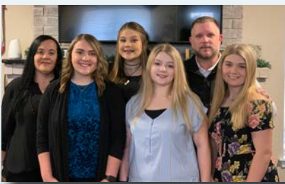
The Bean Family