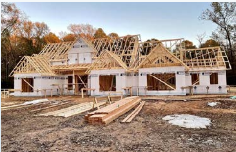
Projects going up steady is what we like to see