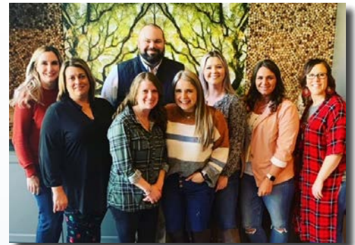
Celebrating our controllers with a luncheon

Union Grove ISD~Longview Animal Care & Adoption~Heartisans