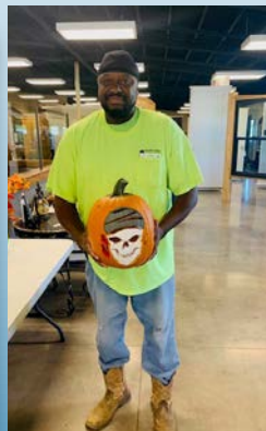
Tee won Best Pumpkin