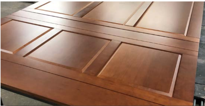
Finished elevator interior wall for Texas State Capitol