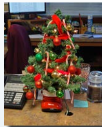
Christmas Tree oh Christmas Tree